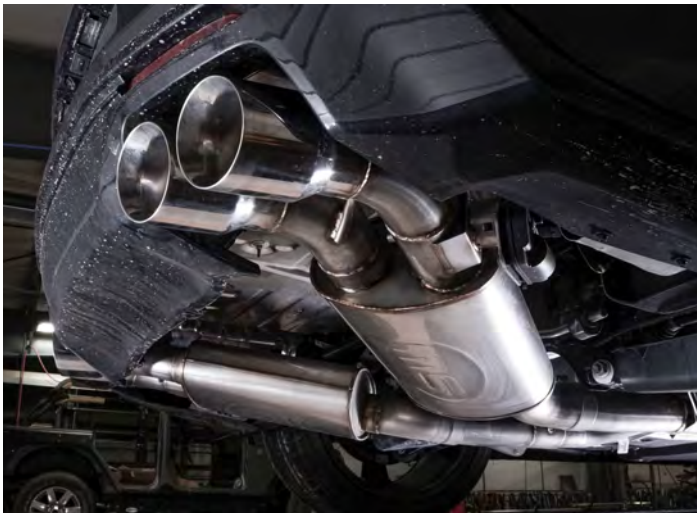
QUAD TIPS Valves in tailpipes and tips

After double checking for clearance and making sure all lines, wires and hoses are secured, drive the car for 10-20 miles and re-check all clamps and clearances. Your system may be tack welded at the joints/ clamps to reduce shifting of the system during heating and cooling cycles. Make certain to disconnect the battery before performing any welding.