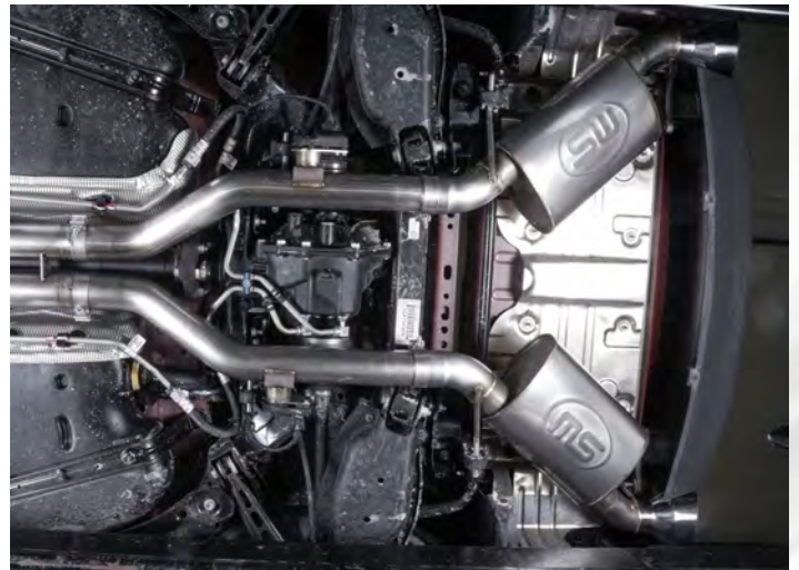
DUAL TIP Valves in tailpipes