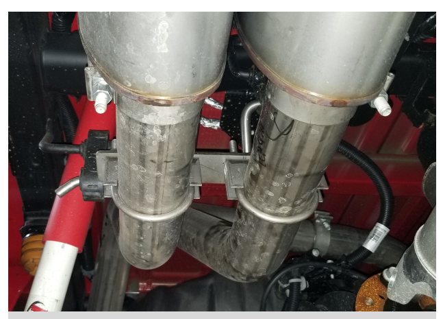
Detail 12: Hanger assembly behind mufflers