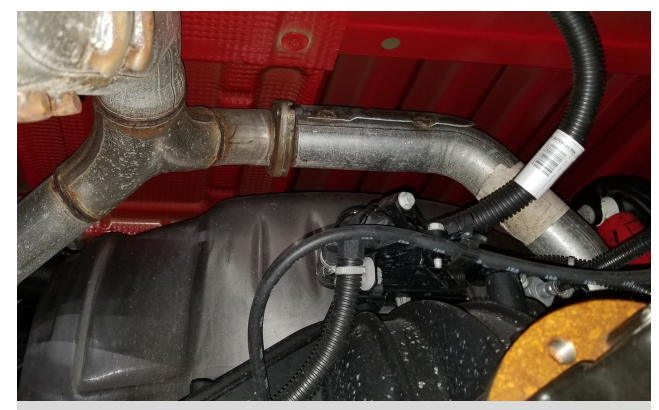
Detail 4: Left tail OEM flange connection