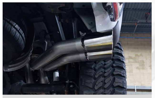
Detail 14: System installed. View from rear of vehicle.