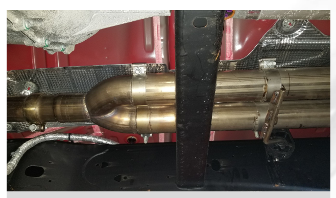
Detail 9: Y-pipe connection and inlet pipe hanger installed.