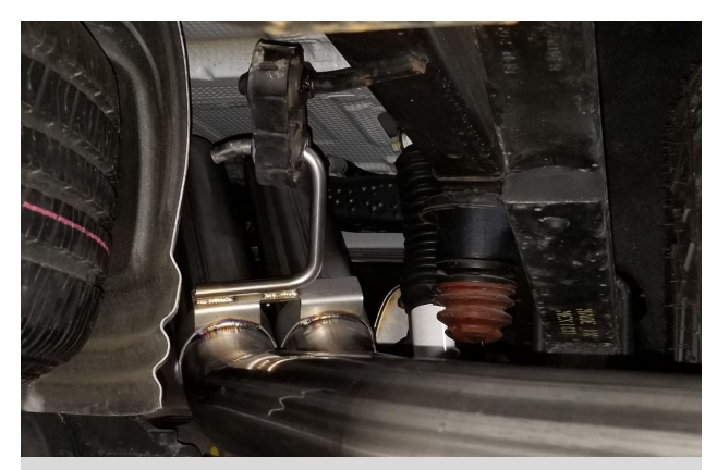
Detail 13: Rear tail hanger assembly, viewed from rear of vehicle.