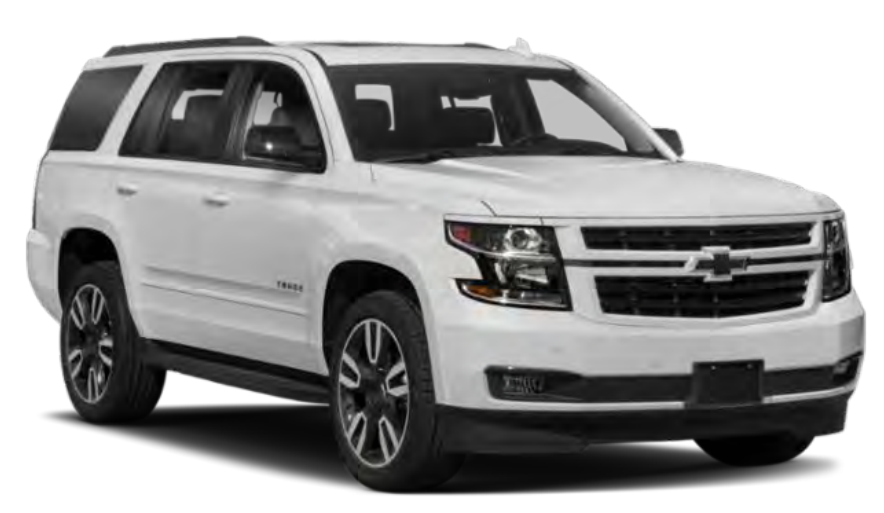
2015-19 Tahoe / Yukon (CTTH15CB)

Thanks for purchasing a Stainless Works catback exhaust system for your 2015-19 Chevy Tahoe / GMC Yukon. Our team has worked to ensure that this product is the premium in performance, quality, and fitment. We are proud to say that this system will unleash the true character of your vehicle. We encourage you to read through the following steps, and check the included Bill of Materials before beginning. Please follow these steps to ensure that your installation goes as planned.