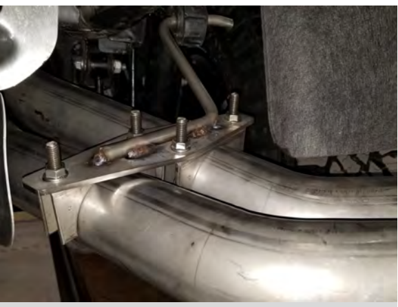
Detail 16: Tail hanger viewed from rear of vehicle.